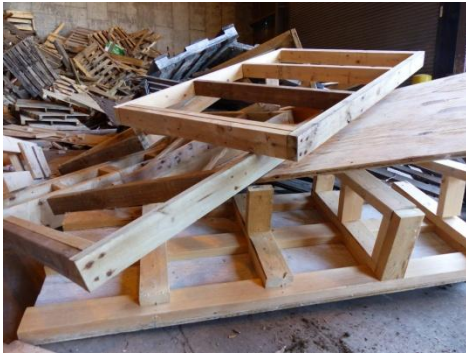
Clean Wood Diversion

Diversion from Landfill: This includes ancillary transfer station equipment that provide loading services and source separation of construction and demolition materials, textiles, shingles, metals, rigid plastics, and other recyclables that can be off-hauled for processing rather than being landfilled.