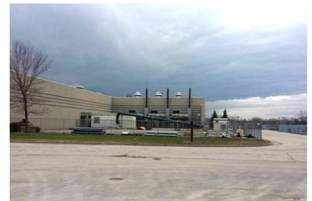
Co-Gen Facility Heats Highway Building

Landfill gas systems are designed to begin collection during earliest stages of Northeast Landfill operation. They send LFG under vacuum to the cogeneration system. Collection for all three landfills, including extraction well, header pipe and condensate systems, is operated and maintained by Outagamie County personnel. Fine-tuning includes wellhead monitoring of vacuum, oxygen, methane and other parameters to optimize collection, renewable energy production, and regulatory compliance. The 1988-2012 East Landfill pioneered LFG collection from horizontal leachate piping at the landfill bottom. The Northeast Landfill is highly proactive employing horizontal collection piping along with leachate recirculation systems. The horizontal collectors are placed at specific waste lifts and elevations throughout the landfill. They deliver consistently high-quality and high-quantity gas and will do so over 10-20 years or more. Presently 1,500 standard cubic feet per minute of LFG are delivered to the energy plant, 850 SCFM of which comes from the Northeast Landfill.