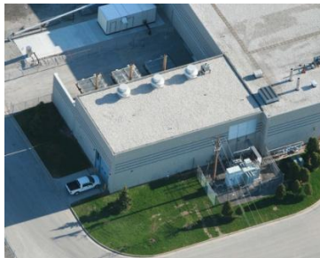
Aerial View of Co-Gen Facility