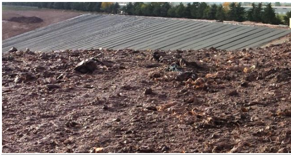
Posi-Shell Layer Provides Daily Cover