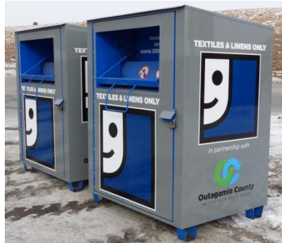
Textile Diversion Partnered with 100% Non-Profit Goodwill Industries