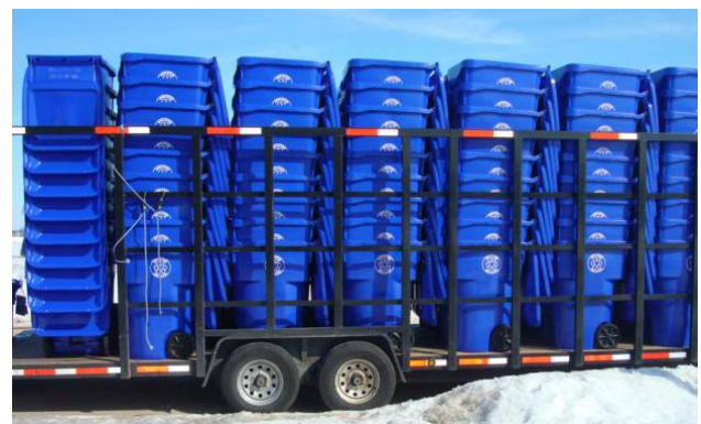
City of Appleton Single-Stream Carts Roll-out

Long-term Vision & Leadership: Effective vision and leadership, supported by the public and elected officials, ultimately create great opportunities and successes. Outagamie County's 40-year program progressed based on this belief. Continuing progress results from solid landfill business, innovation and excellence in landfill technology, bold analysis and strategy launching from past successes, and commitment to collaboration and cooperation.