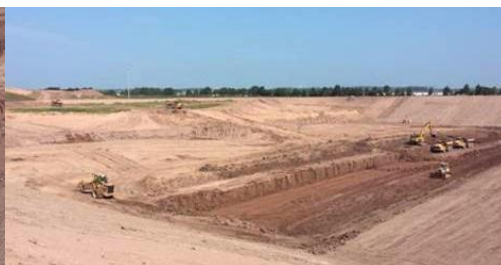
Phase II Flip-Flop Method