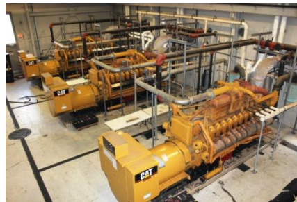
Co-Gen Facility Caterpillar Engines