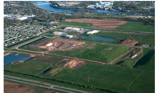
Outagamie County Complex in Lower Fox River Basin