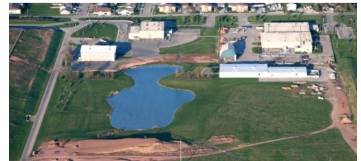
Landfill Sedimentation Basin & Future County Development Area

Surface water runoff from the Northeast and East Landfills drains to one sedimentation basin. The West Landfill is served by a second basin. Both discharges are analyzed monthly for suspended solids, turbidity, field conductivity and pH, hardness, chloride and COD. Upstream sediment generation is minimized by using best management practices for erosion control.