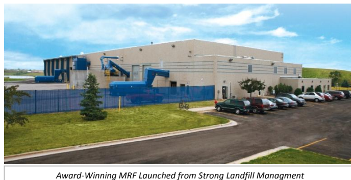
Award-Winning MRF Launched from Strong Landfill Management

Thank-you, SWANA, on behalf of all participants mentioned above for the opportunity to submit this Landfill Management excellence entry.