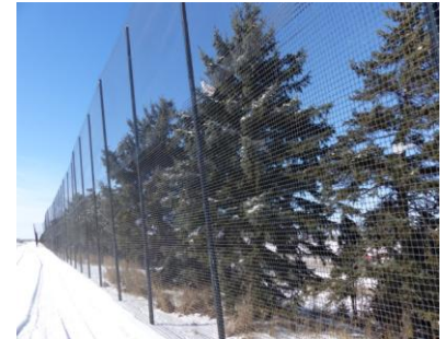
20-Foot High Fencing Along Interstate