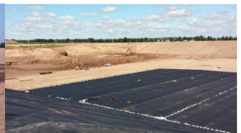
Phase II Liner Installation