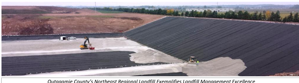
Outagamie County's Northeast Regional Landfill Exemplifies Landfill Management Excellence

Landfill management committed to environmental protection, public acceptance, program sustainability, innovation, and excellence can lead the industry from a single mission of disposal to a broader mission of integrated materials management. Outagamie County demonstrates this vision and commitment, building from its foundation of historically strong landfill management perfected with innovation and leadership.