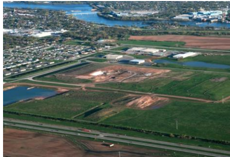
Interstate Highway 41 & Screening Berm Along Bottom Residential Development To Left