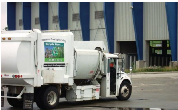
Single-Stream Recycling Truck

Periodic Program Changes: Program changes require effective education and community relations. An excellent example is Outagamie County's present goal, using Lean Improvement, to convert more communities from manual curbside recycling collection to automated collection using wheeled carts. This conversion, through community outreach, will encourage increased recycling, decreased landfilling, and strengthened sustainability.