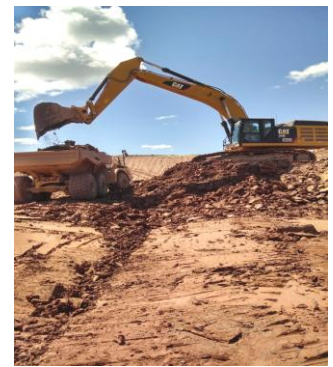
Phase II Sub-Grade Excavation

The Outagamie County Northeast Landfill securely manages waste in the world-renowned glacial geology of Wisconsin. Site soil and geologic characteristics are ideal for long-term environmental integrity of landfill management. Outagamie chose the site for these reasons and placed it into operation during 1975. Rigorous Northeast Landfill investigations by CH2M Hill confirmed site suitability for long-term landfill operation. The site may serve Outagamie County's landfill management needs for 100 years or more.