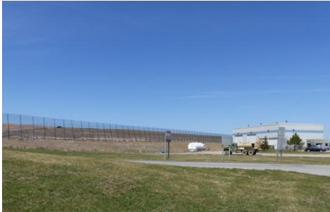
Fencing Along Residential Development