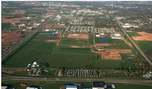
450-Acre Outagamie County Complex

Community involvement is essential in planning final end use. Green-space legacy discussions will be at the forefront of planning to best serve the community at-large. The Outagamie County Parks Department sponsors a dog park in the southwest portion of the site. Pet owners have enjoyed the park since 1997. Nature-trail corridors will also be considered, including walking, biking and hiking options. Other considerations will include status of transfer station, landfill or recycling operations; possible eco-park or resource-recovery park development; and last-chance mercantile or other material recovery options. In addition, future development area for other Outagamie County departments may be considered.