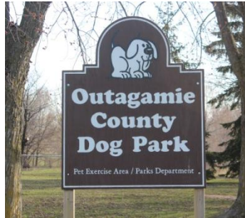
Popular Dog Park on Landfill Site