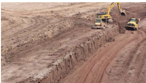
Phase II Sub-Grade Excavation

An efficient technique is used to construct the four-foot compacted-clay low-permeability liner. Abundance of suitable in situ clay allows for a highly-efficient "flip-flop method". Excess volumes of clay are removed leaving the clay volume required for liner construction within the cell. Side slopes are first excavated or filled to design subbase elevation. Then a "bay" or section of the floor is excavated down to subbase elevation with the excavated material placed as compacted lifts creating the clay liner on the slope. Upon completion of side slope clay liner and excavation of the first bay to subbase, the liner construction "flip-flop" begins whereby an equally-sized section or bay is excavated and placed as compacted clay liner in the previously excavated bay. This method provides a much shorter haul/cycle than other methods, expediting placement and compaction of clay liner while using minimal equipment and no stockpiling.