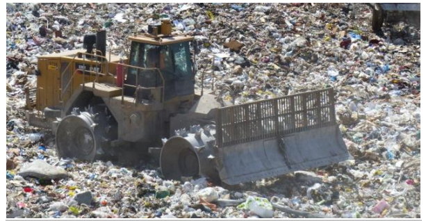
Flat-Cell Method of Compaction