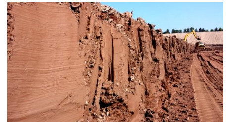
Low-Permeability Clay for Liner Construction

During development over the past 40 years, the site has consistently exhibited a soil surplus. Being "clay-rich" makes construction a relatively smooth process. Special planning is required because liner-quality clay is not present at ground surface but rather 15-30 feet below grade. Overburden soils with lower clay content are used for intermediate cover and the final cover system rooting zone.